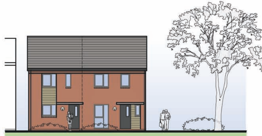
No.73 Plot 1 Plot 2 VIEW TO PALL MALL