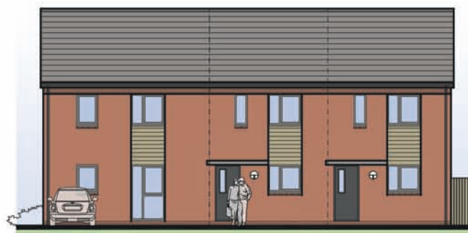
Plot 3 Plot 4 Plot 5 VIEW WITHIN THE SITE